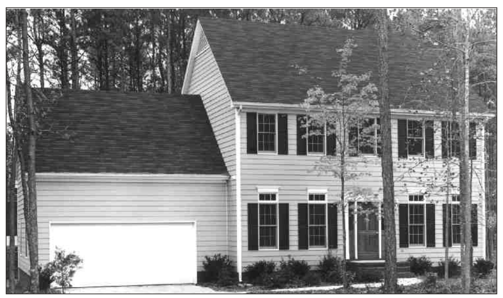
Note: Home in photo may have been modified from the original plans.