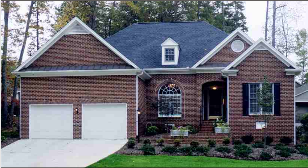
Note: Home in photo may have been modified from the original plans.