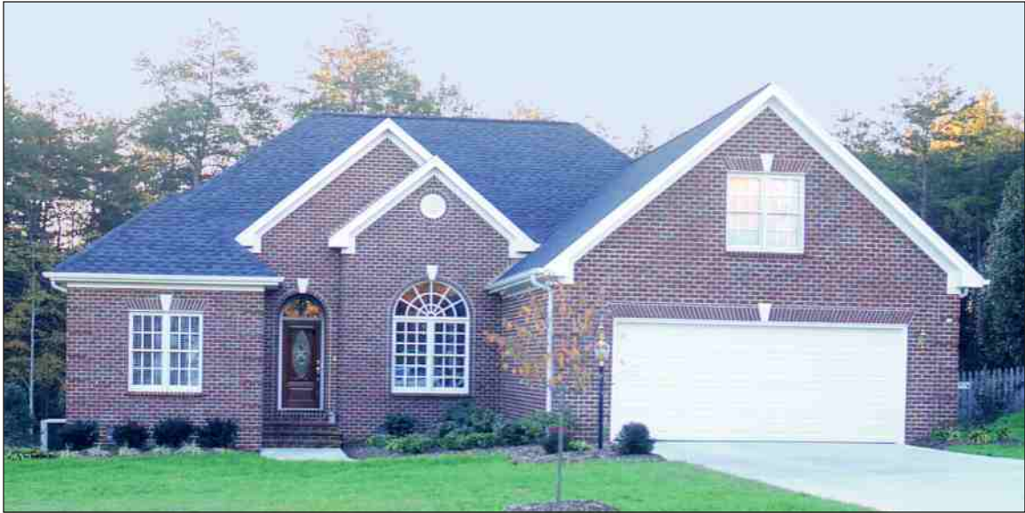
Note: Home in photo may have been modified from the original plans.

Plan No: SP1779G1 Total Heated: 1779 sf Bonus Room: 312 sf Dimensions: 54'-10" w x 60'-10" d 3 Bedrooms, 2 Baths Price Code: B