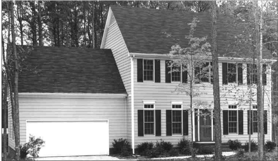
Note: Home in photo may have been modified from the original plans.

Plan No: SP1680G1 Total Heated: 1680 sf First Floor: 876 sf Second Floor: 804 sf Bonus Room: 264 sf Dimensions: 56'-4" w x 36'-0" d 3 Bedrooms, 2 1/2 Baths Price Code: B