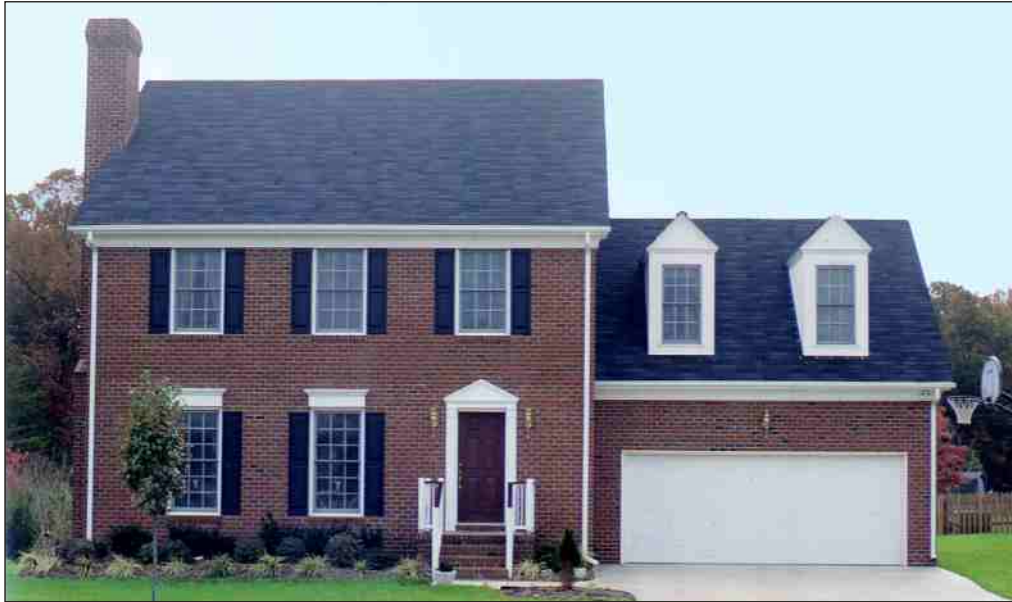
Note: Home in photo may have been modified from the original plans.