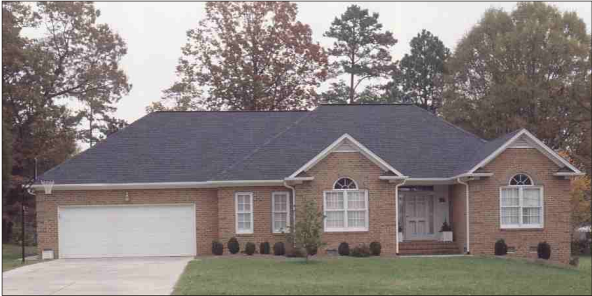
Note: Home in photo may have been modified from the original plans.